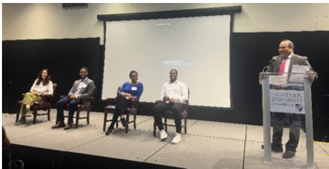
SAMHSA Fellows Panel speaking to youth leaders