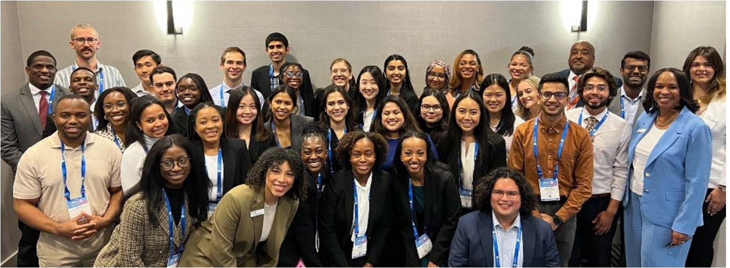
APA Annual Meeting Medical Student Luncheon: Summer Medical Student Program 2023 Cohort